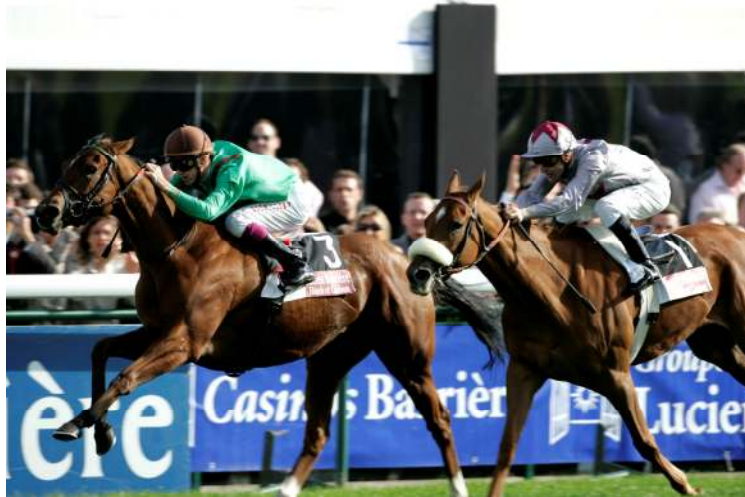
Mandesha proves too good for Satwa Queen in the Prix de l'Opera.