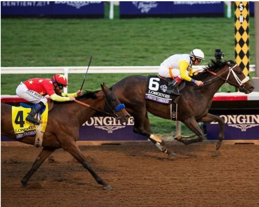
Forever Unbridled winning the Breeders' Cup Distaff from Abel Tasman.