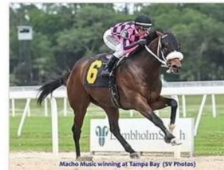
Macho Music winning at Tampa Bay

MACHO MUSIC may be a tough contender and morning line 12-1 is far too big a price about this fast improving colt . Like Gate to Wire, he could be a horse that doesn't care much for further than seven panels, but he was visually impressive when winning at Tampa Bay Downs in late March, powering home by 'half the stretch' from P Four and Cajun Venom. Macho Music's time was almost 2 seconds better than the time recorded by Win N Your In in the fillies' divisions (she won by 7 lengths) and he did not beat cheap claimers in this race. P Four was exiting a 5 1/4-length maiden win and Cajun Venom won an allowance race by almost three lengths next time out. This is one of those case where we need to ask ourselves "how moderate can the horses he beat actually be?". Even when assessing his runner-up to Globeform 70 only, Macho Music comes out on Globeform 110. If we compare him to Win N Your In using their times, well, then he comes out with an even higher ratings. Either way, he has clearly turned a corner in recent weeks and the way he was ridden out, and kept going, indicates that a mile is within his compass. His dam won 4 of her 7 races, including a stakes event over 7 furlongs; but she was also third in an 8.5-furlong allowance heat at Keeneland as a juvenile, so could not have been all about speed. Download the full preview